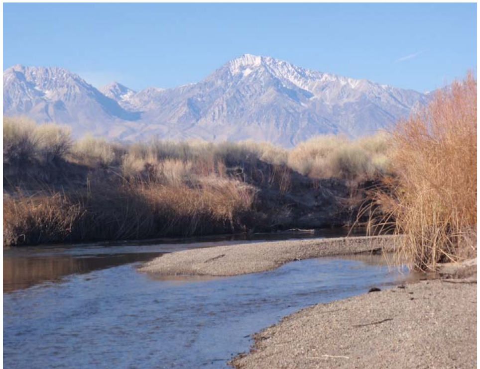
Scenic shot of the lower Owens River.

expertly setting up so I could fish the deeper pools and converging currents. Catching fish meant finding the right spot as the general overall bite was not happening. We did find and catch quite a few rainbows. Finding the spot generally meant catching more the one fish followed by stretches of beautiful scenery. By 10 a.m. I was shedding layers of clothing as the sun warmed