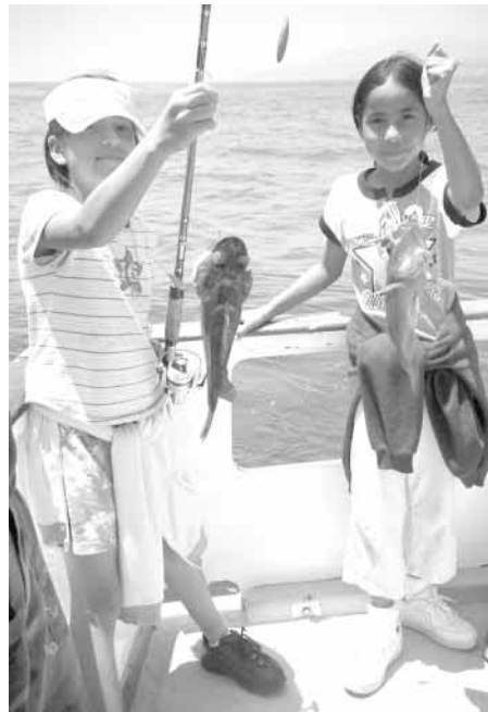
Two on the Kids' Trip