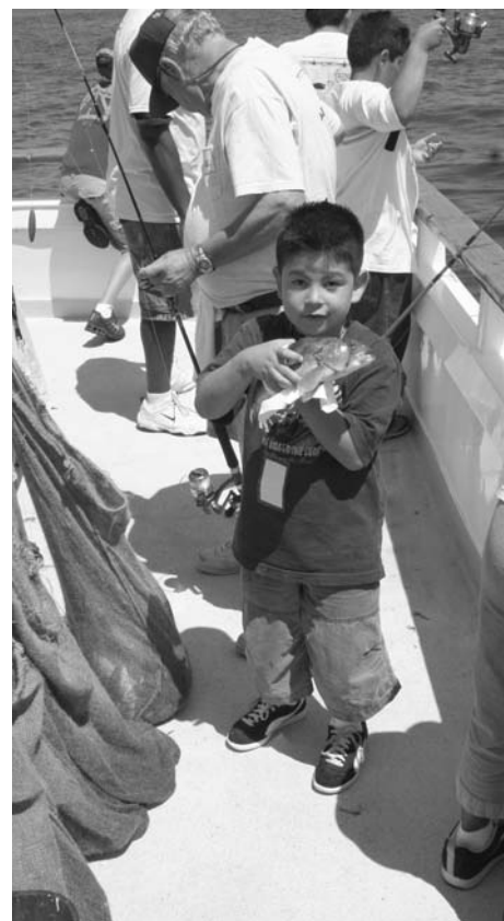
Kid with a fish.

Both morning and afternoon trips were productive for sand bass and a few halibut. Volunteers working both shifts helped immensely. The LARRC Board is considering changing the trip format and going for a single, longer run, possibly leaving the dock at 8 a.m.. In order to