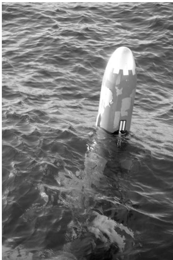
US Air Force target drone.