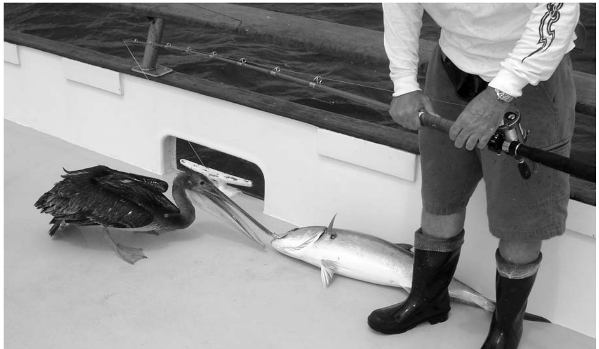
A very hungry Pelican competing for jackpot fish.

Doc Horowitz good a good calico bass and released it. This caused Tom Carlisle