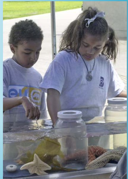
Viewing Cabrillo exhibit.