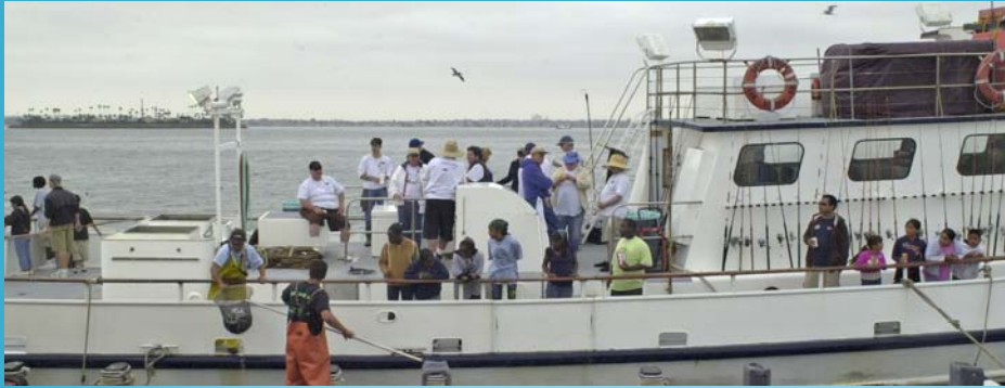
Taking on bait.

Dedicated to Fishing, Fun, Relaxation, and Companionship!