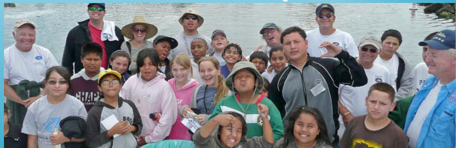
Happy gang on the Southern Cal.