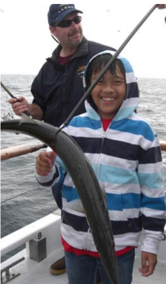
Her first barracuda.