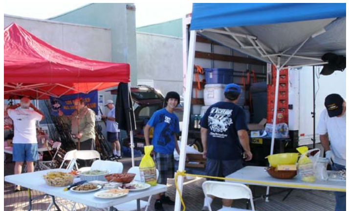
Shot of the waterfront/embarking kids.