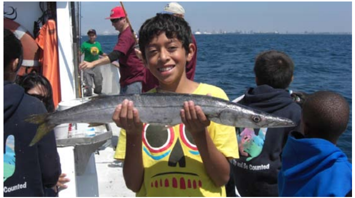
Boy with his first ever barracuda.

also bragged about their experiences aboard! Some wanted to sign up for next year.