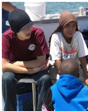
Kids taking a break.