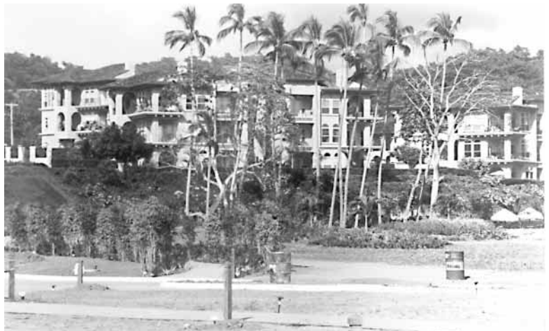
Los Sueños complex, Costa Rica.