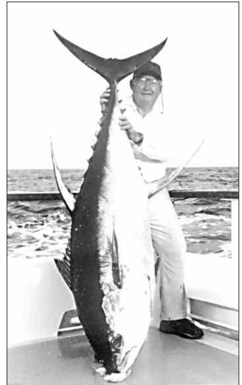
The nemesis of big fish!