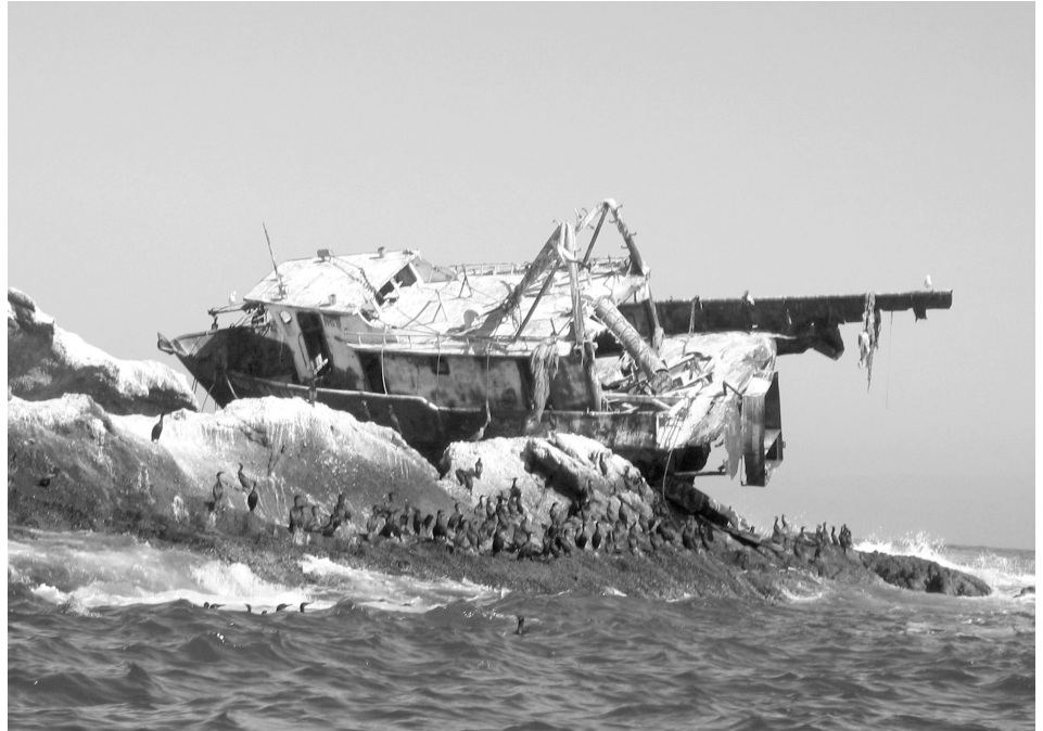
Chester Rock scene.

Day 5 was spent in the lee of Cedros. The fishing ranged from good to slow depending on location and time of day. The wind wasn't a big problem in the lee, but everyone was