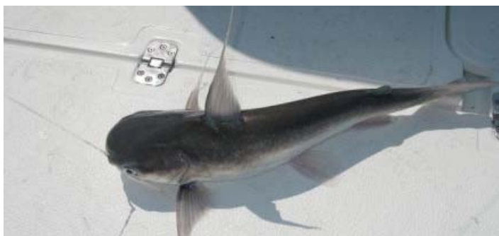
TOP LEFT: Group Shot BOTTOM LEFT: Launch Ramp BELOW TOP: Sail Catfish BELOW BOTTOM; Tarpon at Boat