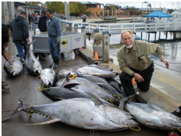
Tuna Sandwich anyone?

only passenger who hadn't landed a tuna the last afternoon, a 356-lb. fish, considered the largest tuna ever to be landed by the EXCEL . The boat with its huge bait volume was also in a good position to chum up the big fish like no other long ranger and we had the added benefit of not having to make bait in the middle of the night. I ended the trip with 10 tuna totaling 1485 lbs. A very "alta cucker" of a fisherman. ■