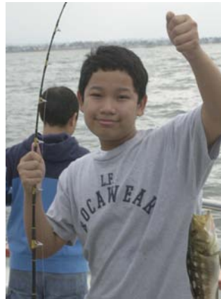
Above: Mid-Valley YMCA. Right: Her first fish.

tion facility. This was a mostly teenage group that was pleasantly enthusiastic, since many of them had never been on