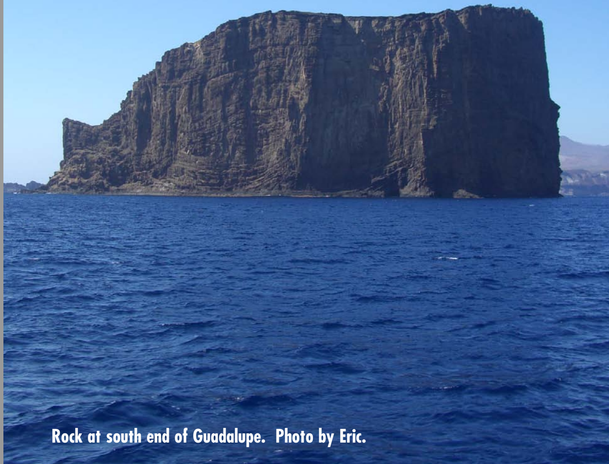
Rock at south end of Guadalupe.