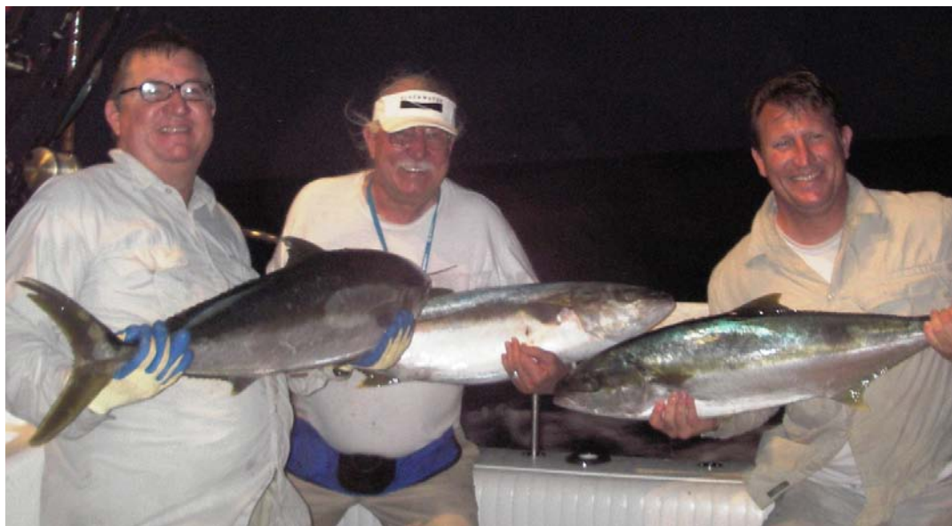
BELOW: Three Happy Heroes