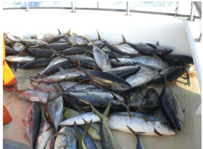
TOP: Group in the Stern