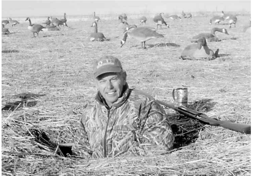
This quacks us up! Its about time we had something other than a fish picture.

I am an avid bird hunter and started quail hunting with my best friend in Mexico when I was eighteen years old; duck and goose hunted many years with my father at Tule Lake, CA; and for the past 9 years I have participated in an annual goose hunting trip to Saskatchewan, and an annual dove and quail hunting trip to Los Moches, Mexico. Although the hunting has been very poor over the past few years, I am currently a member of a duck hunting club in the