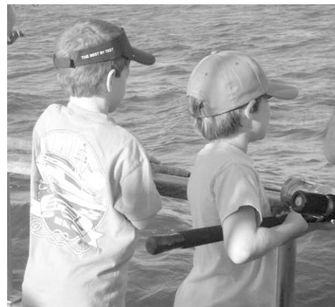
Kids' on Twilight Trip.